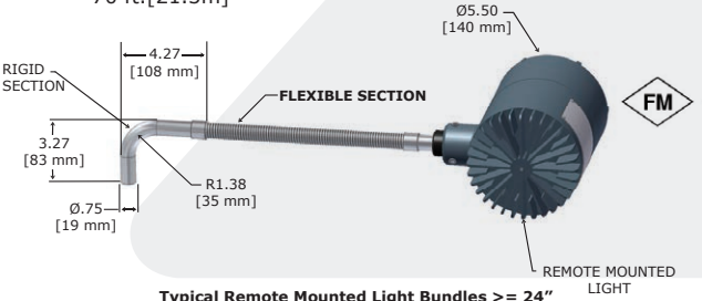
Typical Remote Mounted Light Bundles >= 24"

80 W - Typical tank diameter 25 ft. [7.6m], max. depth 70 ft.[21.3m]