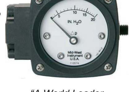
"A World Leader in Differential Pressure Gauges, Switches & Transmitters

Model 142 with 2-1/2" Dial & 4-20mA Transmitter