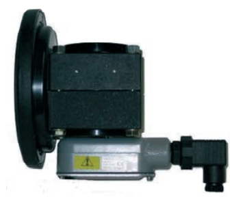
Shown w/Aluminum Body & (1) Reed Switch with Condulet enclosure and Plug-In Connector (Din 46350-PG 11)

CSA listed control switching is available in an explosion-proof enclosure which complies with NEC Class I, Groups C and D; Class II Groups E, F, and G; NEMA 7 and 9 standards. These are machined cast-aluminum enclosures with 1/2" FNPT conduit connection and 24" wire leads.