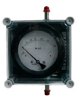
Shown in NEMA 4X Plastic enclosures

Factory preset switch at no extra charge (Specify Setting) Specify increasing or decreasing range to be set.