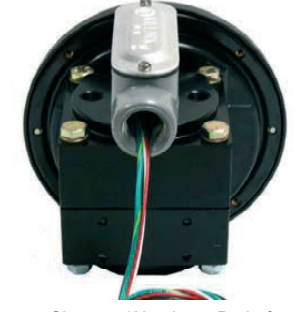
Shown w/Aluminum Body & (1) Reed Switch in Condulet enclosure

Model 130 is available in Aluminum, Brass and 316SS bodies only with one or two hermetically sealed reed switches for low and/or high limit alarm. These CSA listed switches are Single Pole Double Throw (SPDT) with adjustable set points. Switches can be set to activate/deactivate on rising or falling pressure. Switches are enclosed in a weather resistant housing. Switch setting is readily made with a screw adjustment.