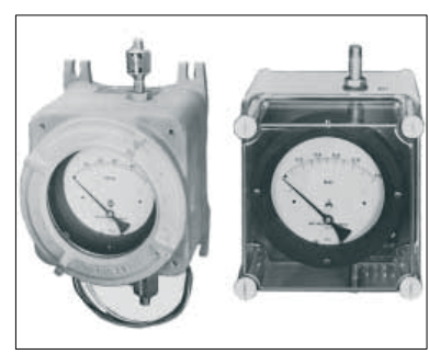
Model 130 in Explosion Proof (left) and NEMA 4X (right) enclosures