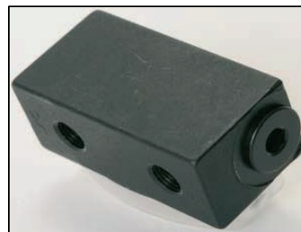
Model 126/127 Bottom Connections Shown

6500 Dobry Dr. • Sterling Heights, MI USA • Tel: 800-648-5778 • 586-254-6500 • Fax 586-254-6509 Web Site: www.midwestinstrument.com • Email: sales@midwestinstrument.com