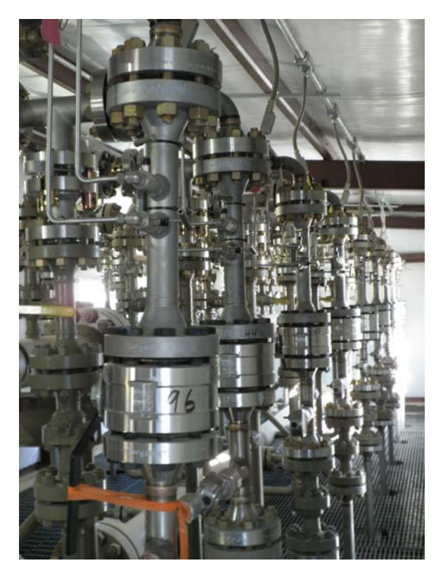
Figure 2: Installed V-Cone Flowmeters

A stainless steel piping split run was installed from the CO<sub>2</sub> gas and water sources to support 16 well heads (Fig 2).