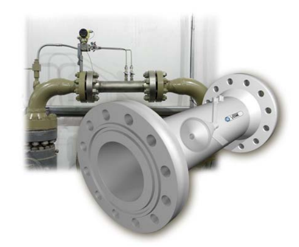
Figure 1: The V-Cone<sup>®</sup> Flow Meter as a master meter

In this particular WAG system, the process engineers required a flow meter to be installed as a master meter at the source tanks for CO<sub>2</sub> and water (Fig. 1).