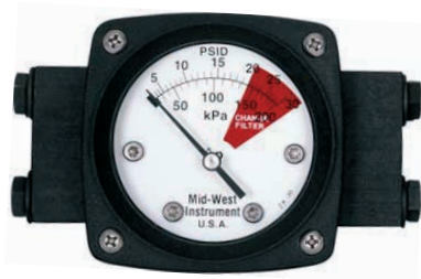
Model 140 0-30 PSID & 0-200 kPa with 2-1/2" Dial & Special Color Dial