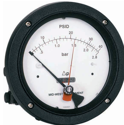
Model 140 0-40 PSID & 0-2.8 Bar with 4-1/2" Dial & maximum follower pointer