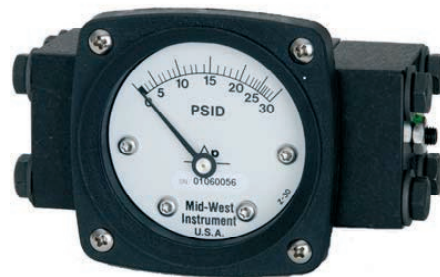
Model 140 0-30 PSID with 2-1/2" Dial

“A World Leader in Differential Pressure Gauges, Switches & Transmitters