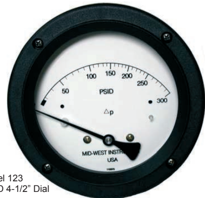
Model 123 0-300 PSID 4-1/2" Dial

An optional maximum indication follower pointer provides automatic indication of maximum differential occurring during a time period or system cycle. Reversed pressure ports are optionally available to facilitate installation and readability depending on which side of a filter, etc., the instrument must be installed.