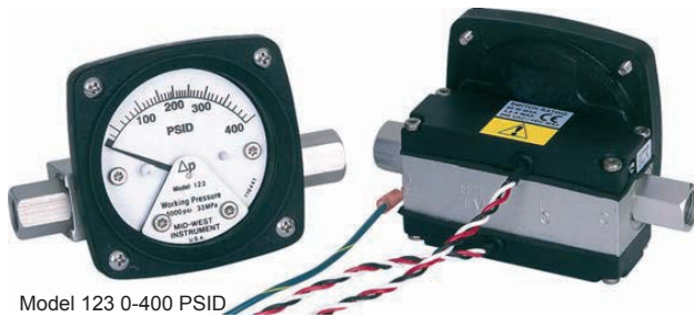
Model 123 0-400 PSID Shown with 2 Std. Switches

Due to precision sizing of piston and body bore, leakage across piston will not exceed 15 SCFH air at 100 PSID at ambient temperature.