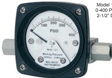
Model 123 0-400 PSID 2-1/2" Dial

A low cost differential pressure gauge for use in measuring the pressure drop across filters, strainers, separators, valves, pumps, chillers, etc., and for local flow indication and control.