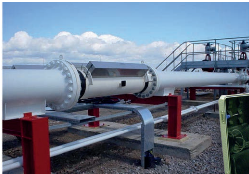
Self-powered flow computer incorporated in Aluminium case