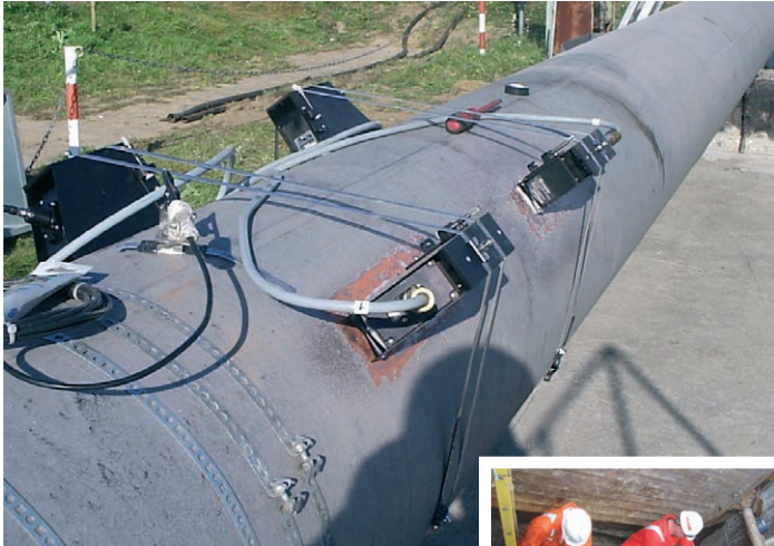
(Inset) Underground, submersible installation for 56 inch (1425 mm) pipe. Clamp-on sensors are quickly installed, without interrupting flow.