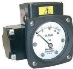
Model 142 shown with “BA” switch option

(2) Reed switches located inside NEMA 4x enclosure with 7 position terminal strip. An opening at rear of enclosure accepts ½” flexible weather-proof or conduit connector (supplied by customer).