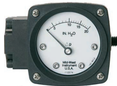
Model 142 0-20" H2O with 2-1/2" Dial

“A World Leader in Differential Pressure Gauges, Switches & Transmitters