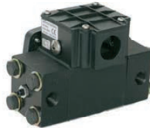
Model 140 shown with “AA” switch option

(1) Reed switch located inside NEMA 4x enclosure with 7 position terminal strip. An opening at rear of enclosure accepts ½” flexible weather-proof or conduit connector (supplied by customer).