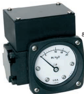
Model 142 with 2-1/2" Dial & 4-20mA Transmitter