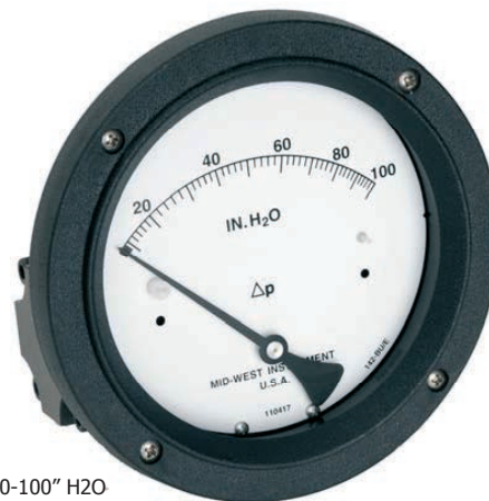
Model 142 0-100" H2O with 4-1/2" Dial