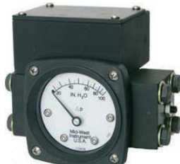
Model 140 shown with “EA” switch option.

(1) Reed switch in general purpose enclosure Division 2 Hazardous locations with 7 position terminal strip. An opening at rear of enclosure accepts ½” flexible weather-proof or conduit connector (supplied by customer).