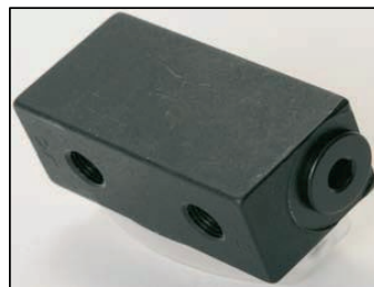
Model 126/127 Bottom Connections Shown

6500 Dobry Dr. • Sterling Heights, MI USA • Tel: 800-648-5778 • 586-254-6500 • Fax 586-254-6509 Web Site: www.midwestinstrument.com • Email: sales@midwestinstrument.com