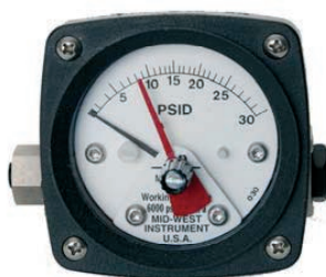
Model 120 0-30 PSID With Maximum Follower Pointer