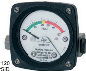
Model 120 0-50 PSID With Special 3 Color Dial

An optional maximum indication follower pointer provides automatic indication of maximum differential occurring during a time period or system cycle. Reversed pressure ports are optionally available to facilitate installation and readability depending on which side of a filter, etc., the instrument must be installed.