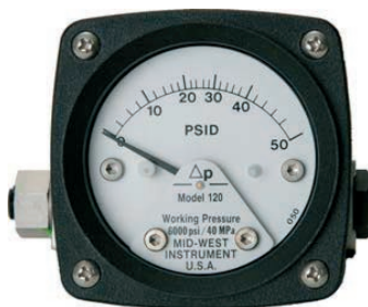
Model 120 0-50 PSID 2-1/2" Dial

A low cost differential pressure gauge for use in measuring the pressure drop across filters, strainers, separators, valves, pumps, chillers, etc., and for local flow indication and control.