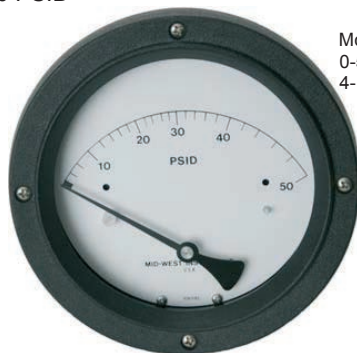
Model 120 0-50 PSID 4-1/2" Dial